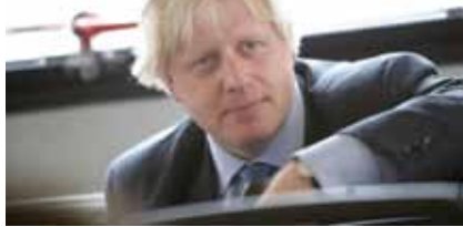
Boris Johnson Mayor of London

That's why from 3 January 2012 the emissions standards will be raised and more vehicles will be affected. In the year when the world heads to London for the Olympic and Paralympic Games, we will demand the highest standards that a great city like ours is entitled to expect.